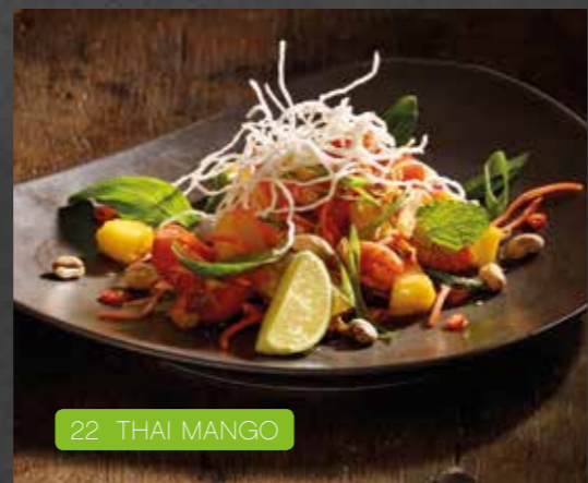
22 THAI MANGO