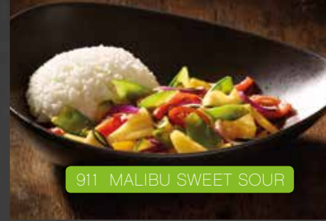
911 MALIBU SWEET SOUR