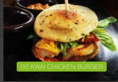
110 KWAI CHICKEN BURGER